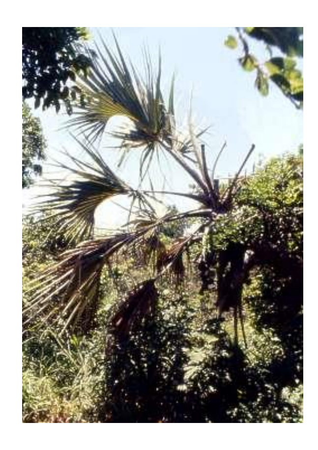
Available at: https://pza.sanbi.org/hyphaene-coriacea

For example: Africa is already undergoing rapid urbanization, resulting in more deforestation and polluted air and water bodies. With the growth of Africa's middle class, there will be a greater aspiration for convenience, including consuming disposable goods, resulting in greater pressure on the environment.