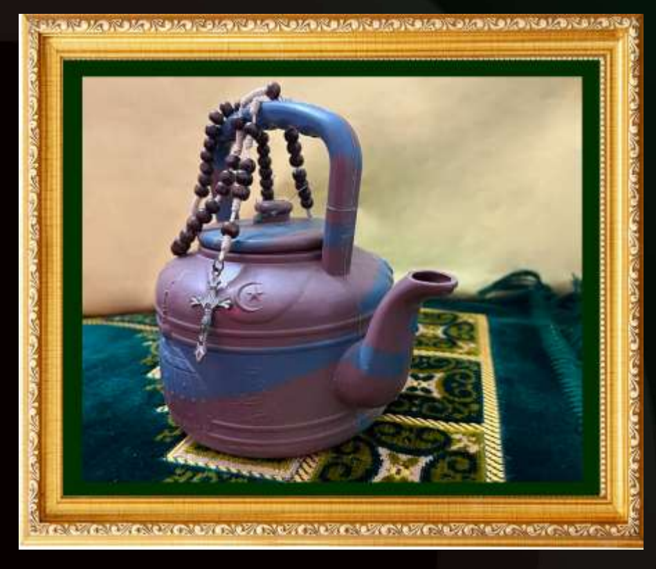
Fig.1: Religious Tolerance.

This piece of Art is a kind of photography known as Conceptual Photography; a concept driven photography that depicts an impression of the Artist. Items found in this piece of art work are just two; An Islamic ablution kettle (representing a symbol for Moslems) and the rosary (representing a symbol for Christians).